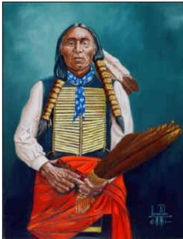
Painting by Leonard Peltier